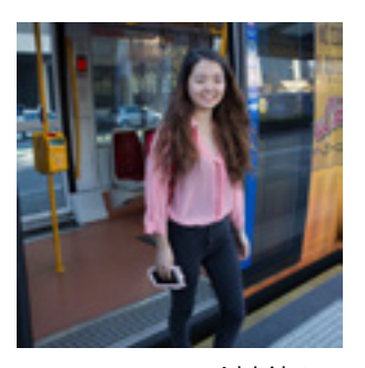
A delaide\, tram

For the latest information on the cost of living and studying in Australia please go online www.studyinaustralia.gov.au