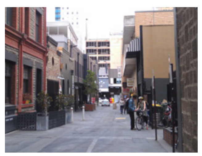
Kaplan International Adelaide