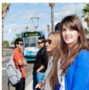
Trams in Melbourne CBD

Melbourne is a very multicultural city and there are places of worship of all religions and faiths close to the college. You can get more information about local religious institutions from the Kaplan staff at reception.