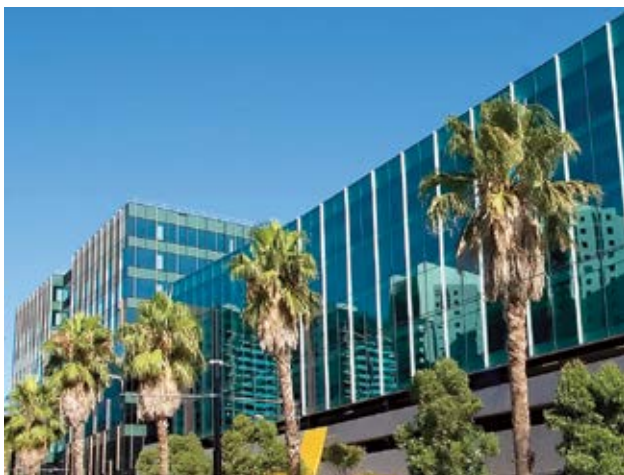
Kaplan International Melbourne