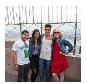
View from the roof top of the Empire State building

There are many mobile phone providers that can provide long-term or short-term plans to suit your needs. There is free wifi at the school during regular hours and from many local businesses in the area.