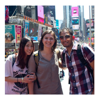
New York Times Square