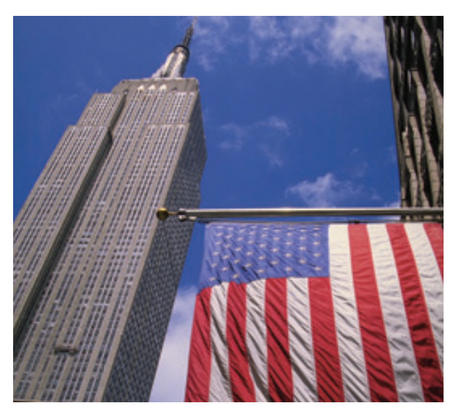
Kaplan International New York Empire State Building