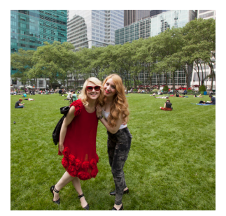
Students exploring NYC