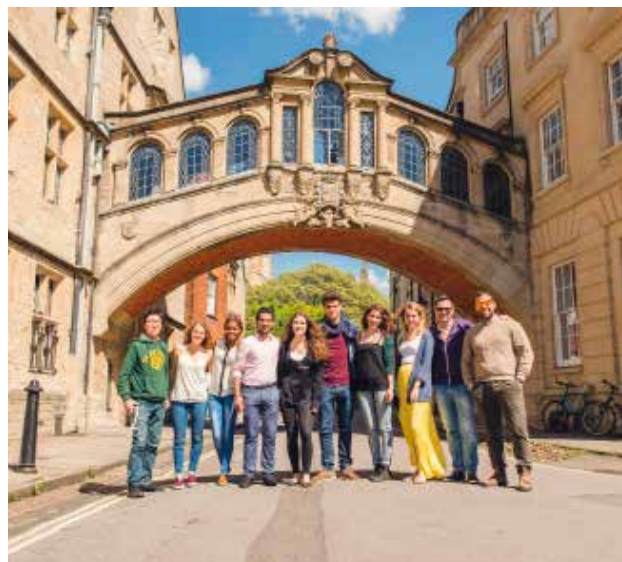
Sightseeing in Oxford