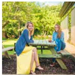
The school garden

There are places of worship for all religions and faiths in Oxford. A list of these and their locations is posted in the school.