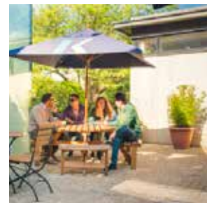
The school garden