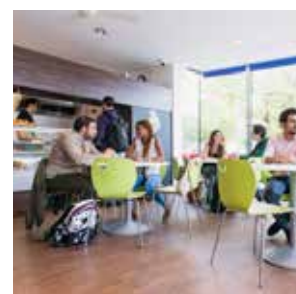
The school café