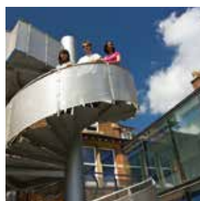
Outside the school café