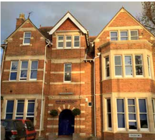
Kaplan International Oxford

Kaplan International Oxford is housed in an attractive Edwardian building with 3 floors and a modern, prize-winning extension. The school is situated just 10 minutes north of Oxford city centre and has a beautiful garden and patio at the back of the building: the perfect area for summer barbeques and social activities. The school also boasts a lively cafe with a friendly atmosphere for our varied student population.