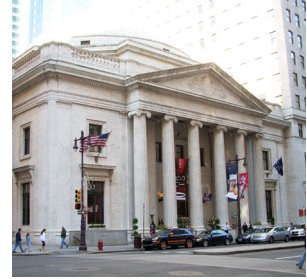
Philadelphia Ritz Carlton