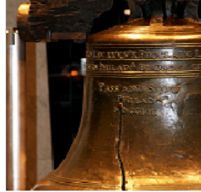
The famous Liberty Bell

There are many cafes and coffee shops in the neighborhood that offer free wifi Internet access.