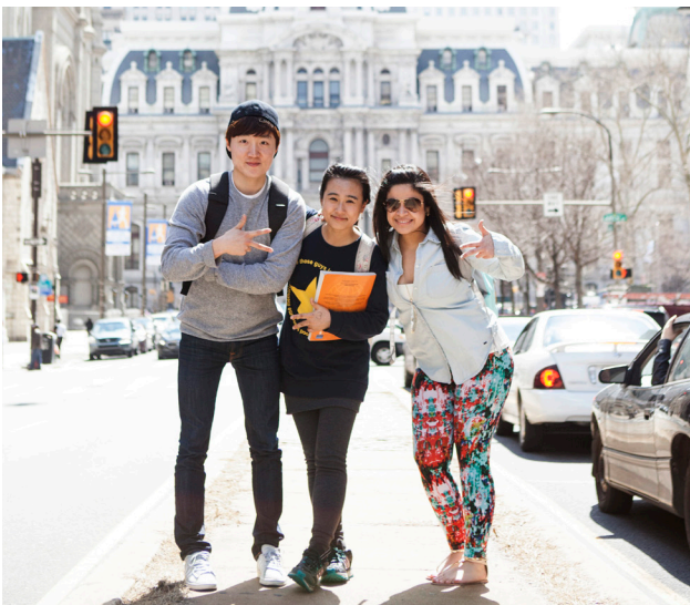
Kaplan International students exploring Philadelphia

Philadelphia is a diverse city, rich in American heritage and the Arts. Independence Hall and the Liberty Bell are just a few examples of the wonders Philadelphia has to offer students. Boutiques, museums, restaurants, and the diverse culture create a feeling that Philadelphia is home to anyone who visits. Philadelphia is the home of over ten highly competitive universities including the University of Pennsylvania.