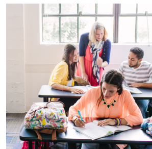
A classroom at Kaplan's Portland school