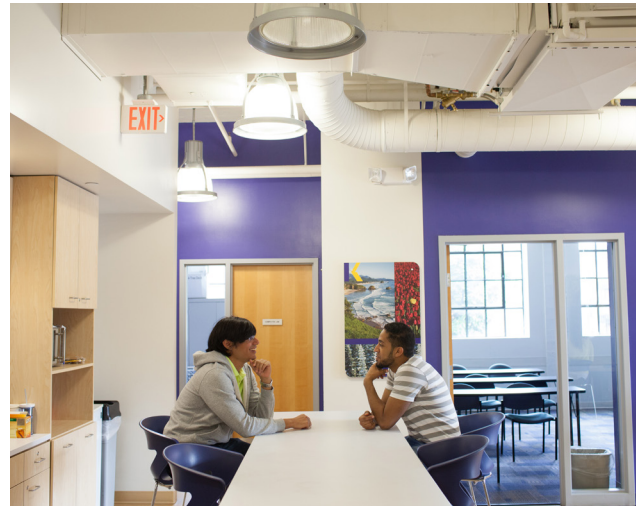
Kaplan Portland school

To get to the Kaplan International Portland from the airport, take the MAX Red Line to City Center and Beaverton TC. Get off at the Galleria/ Library MAX station. Take the street car North for 3 stops and get off at NW 10th and Everett. Walk West to NW 13th Street and Everett. Our building is at 323 NW 13th Ave. Enter the building and take the elevator to the 3rd floor.