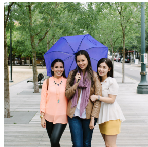
Study in a sociable atmosphere

Public telephones can be found throughout the downtown area and wireless internet is widely available. Computer stations can be used at the nearby public library.