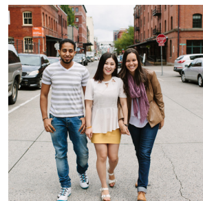
Students exploring Portland