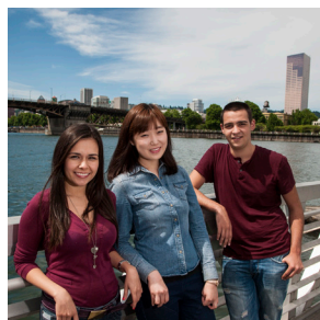
Enjoy the beautiful scenery of Oregon