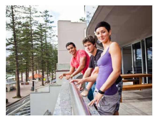
Kaplan International Sydney Manly