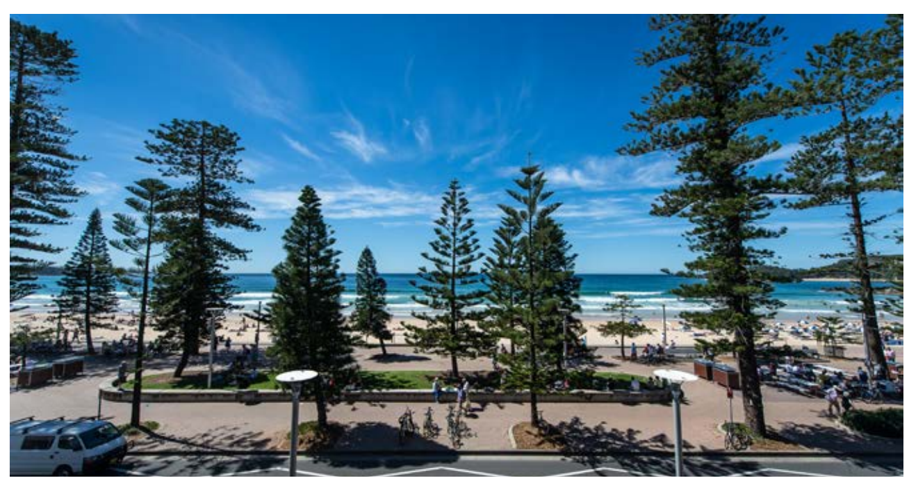
View from Kaplan International Manly