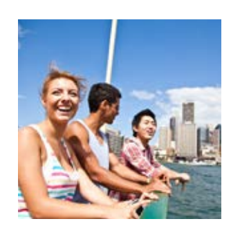
Catch a Ferry to and from Manly