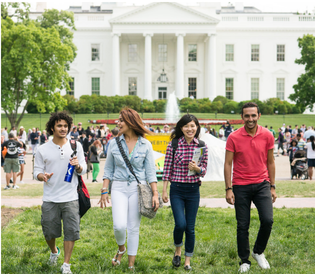
Kaplan students exploring Washington D.C.

The Washington, DC Kaplan International school offers first-class modern facilities with an extensive library of self-study material to be used at the center. The self-study material includes access to the school's dedicated English computer lab with language software, internet and WiFi, and a wide variety of practice language activities which can be developed into individual study plans.